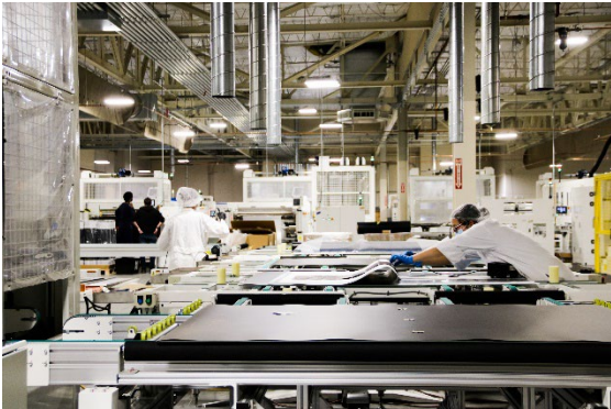
U.S.A. Jobs: S4A employs 200+ Americans at its factories.

Solar4America Technology is America’s Solar Solution for Quality, Performance and Reliability. S4A products are manufactured on American soil in accordance with the highest quality standards. Our investments predate federal incentives because we believe in American renewables manufacturing. With factories in Sacramento, CA and Sumter, SC, S4A provides the latest-technology solar products nationwide.